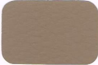
Cobble Brown CN-12 3#