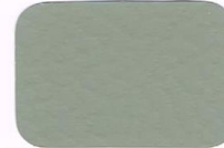
Shadow Green SG-90 3#