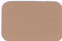
Spice SP-37 2#