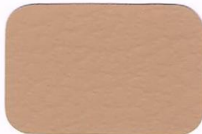
Sunrise Gold S-31 3#