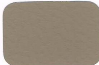
Chestnut N-29 3#