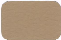
Teakwood K-68 4#