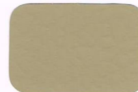
Maize TC-36 3#