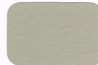
Citron Buff CB-99 1#