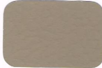
Tuscan Sand CN-12 1-1/2#