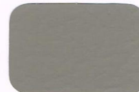
Canyon Brown Y-57 2-1/2#