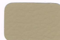
UCR Tan U-27 2#