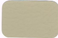
Toasted Cream TC-36 1-1/2#