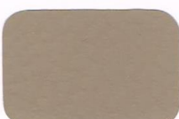
Adobe A-24 2-1/2#