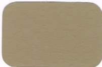
Ginger GI-43 4#