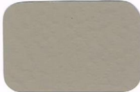
Ecu N-29 1-1/2#