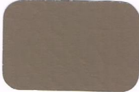
Coffee CO-56 4#