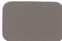
Chocolate C-63 2#