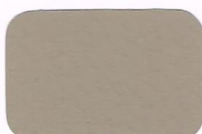
Buckskin Brown A-24 1-1/2#