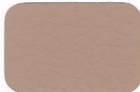
Rosewood W-33 1#