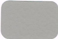
Graystone C-63 1/4#