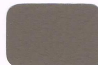
Cal-Tan C-63 3#