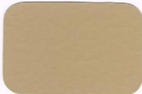
Gold Coast G-29 2-1/2#