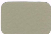
Bisque Q-72 2-1/2#