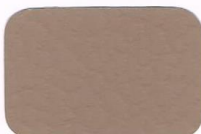
Cinnabar AR-60 2#