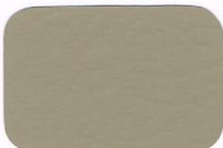
Wheat WH-80 3#