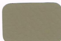
Bronze I-88 3#