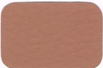
Brick Red R-82 2#