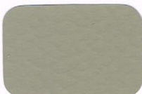
Vintage Gold I-88 2#