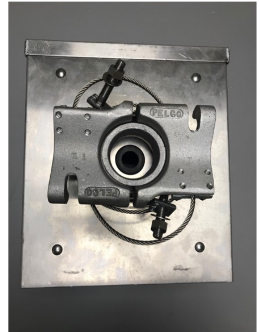
Pelco Stellar Bracket Option