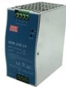
24 VDC 10A Power Supply

24 VDC Power Supply. The amperage can vary depending on how much load is required.