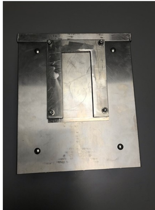
Quick Install Bracket Option