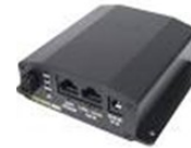
Cellular Router Firewall

24 VDC Power Supply. The amperage can vary depending on how much load is required.