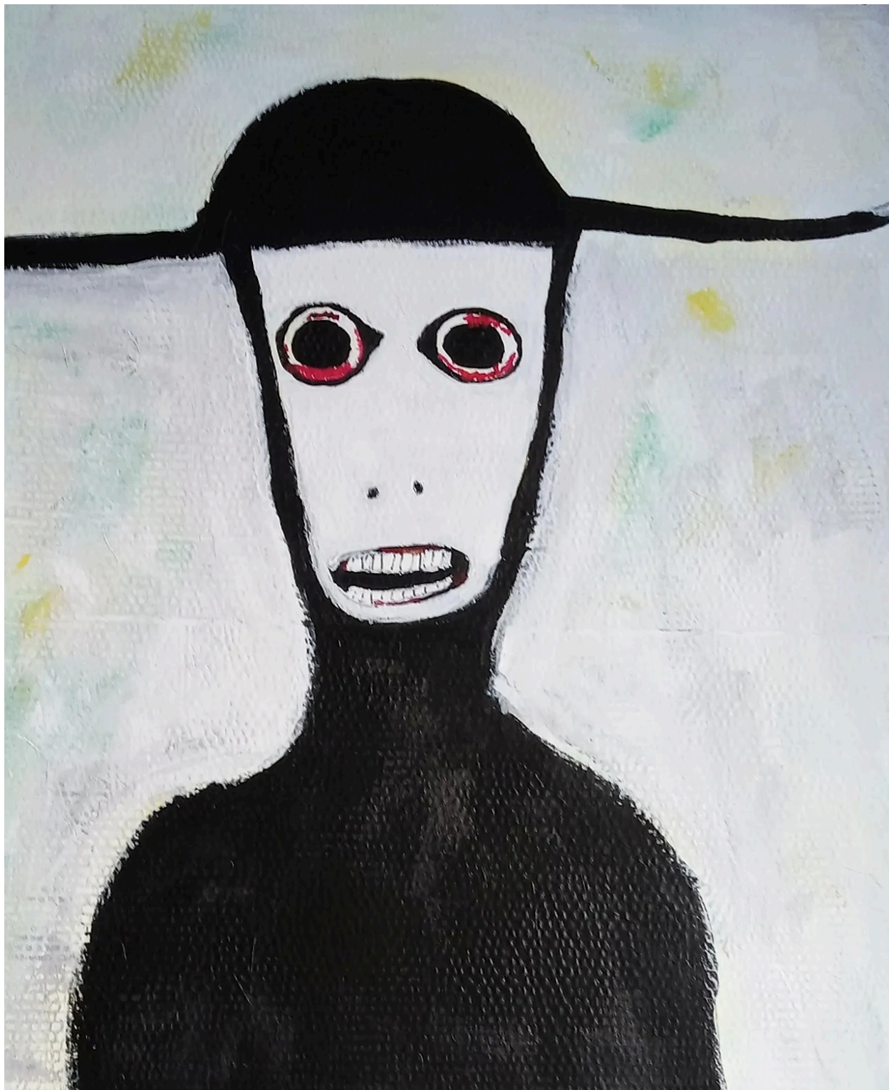
Lorenzo il Mistico, 2023, Acrylic on Board, Mounted on Canvas, 43 x 35 in. Signed. Price: $1,400.000