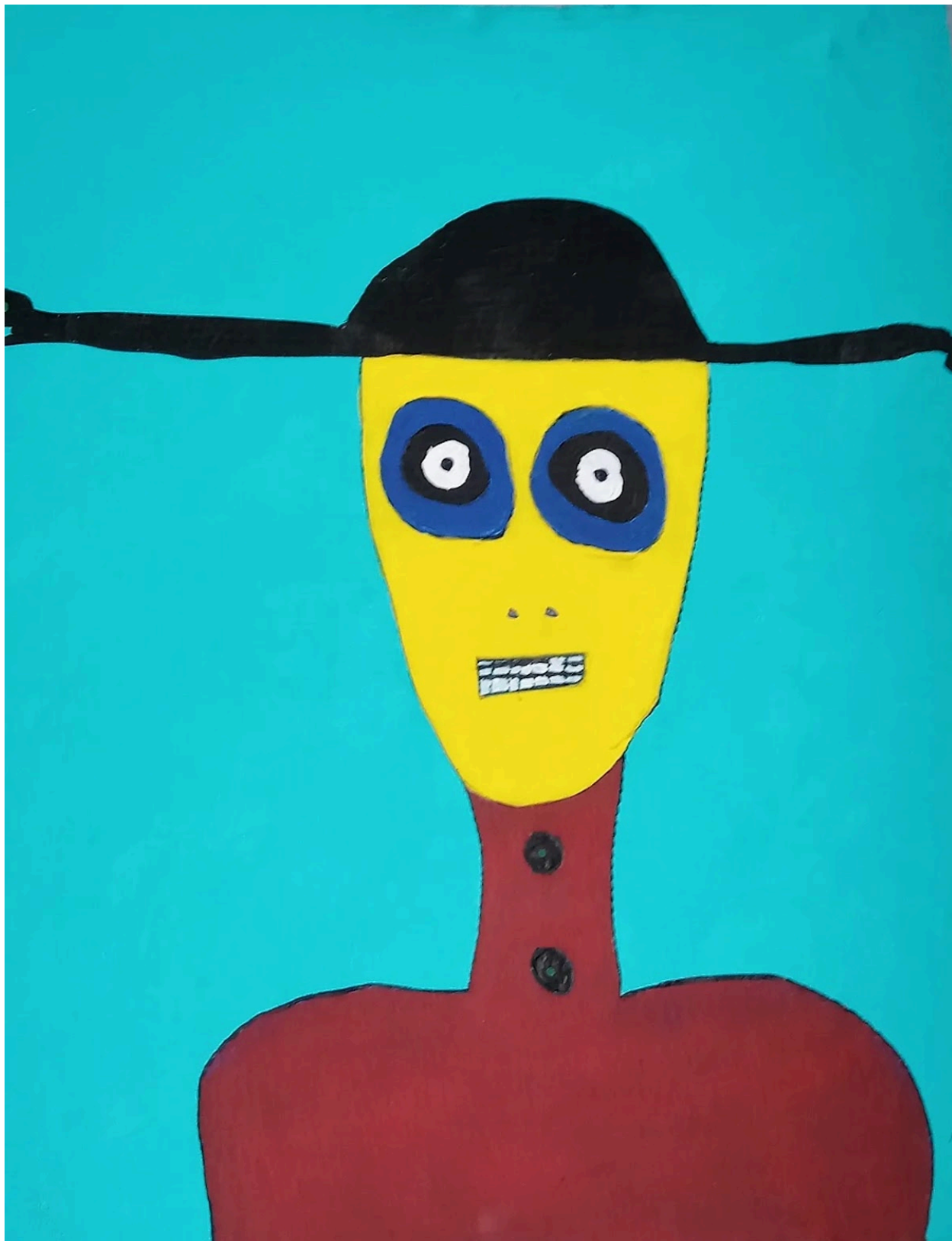
Isabella della Notte, 2023, Acrylic on Board, Mounted on Canvas, 40 x 30 in. Signed. Price: $1,400.000