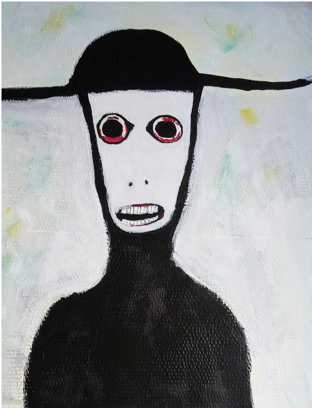
Lorenzo il Mistico, 2014, Acrylic on Board, Mounted on Canvas, 43 x 35 in. Signed. Price: $65,000(USD)