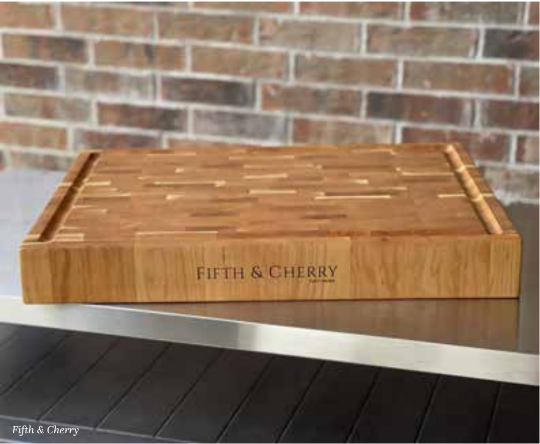
Fifth & Cherry

While a basic value-brand cutting board can get the job done, a premium piece by Fifth & Cherry may become a point of pride for your kitchen. Each one is exceedingly sturdy, helps prevent food contamination, and adds a touch of art to meal preparation. Attribute these many perks to the brand’s craftspeople as well as its sourcing: it uses only responsibly harvested American black cherry tree wood, which offers elegant grain, wonderful coloring, and years of utility.