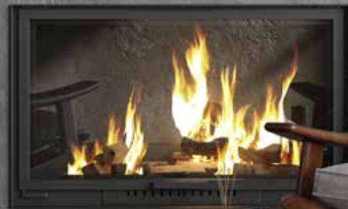
Figure out the fuel

Almost nothing expresses the comforts of home like a fireplace—the perfect cozy spot to retreat to after coming indoors from a chilly night. Such a feature allows you to set a romantic ambience, enjoy treasured gatherings with your family, and savor the natural glow of a flame flickering safely in its hearth. If you're looking to install one in your home, the following tips can help you select and style a truly heartwarming centerpiece.