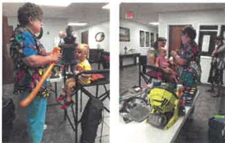
Twinklz the Clown