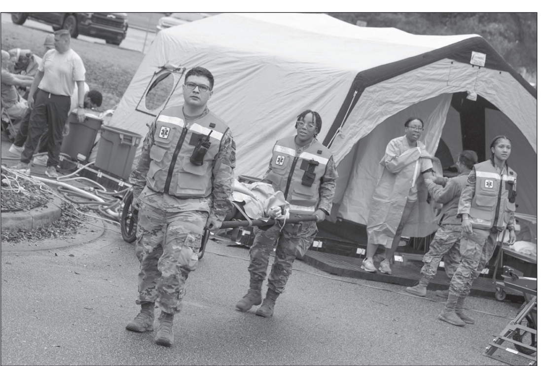
78th Medical Group Manpower team members transport a patient from the decontamination wash down tent to a nearby triage area for medical treatment during the mass casualty decontamination drill. This real world-based exercise allowed Airmen to put their emergency medical training into action in a rapidly changing and robust simulated environment.

"The more we prepare, the better we'll be should the need