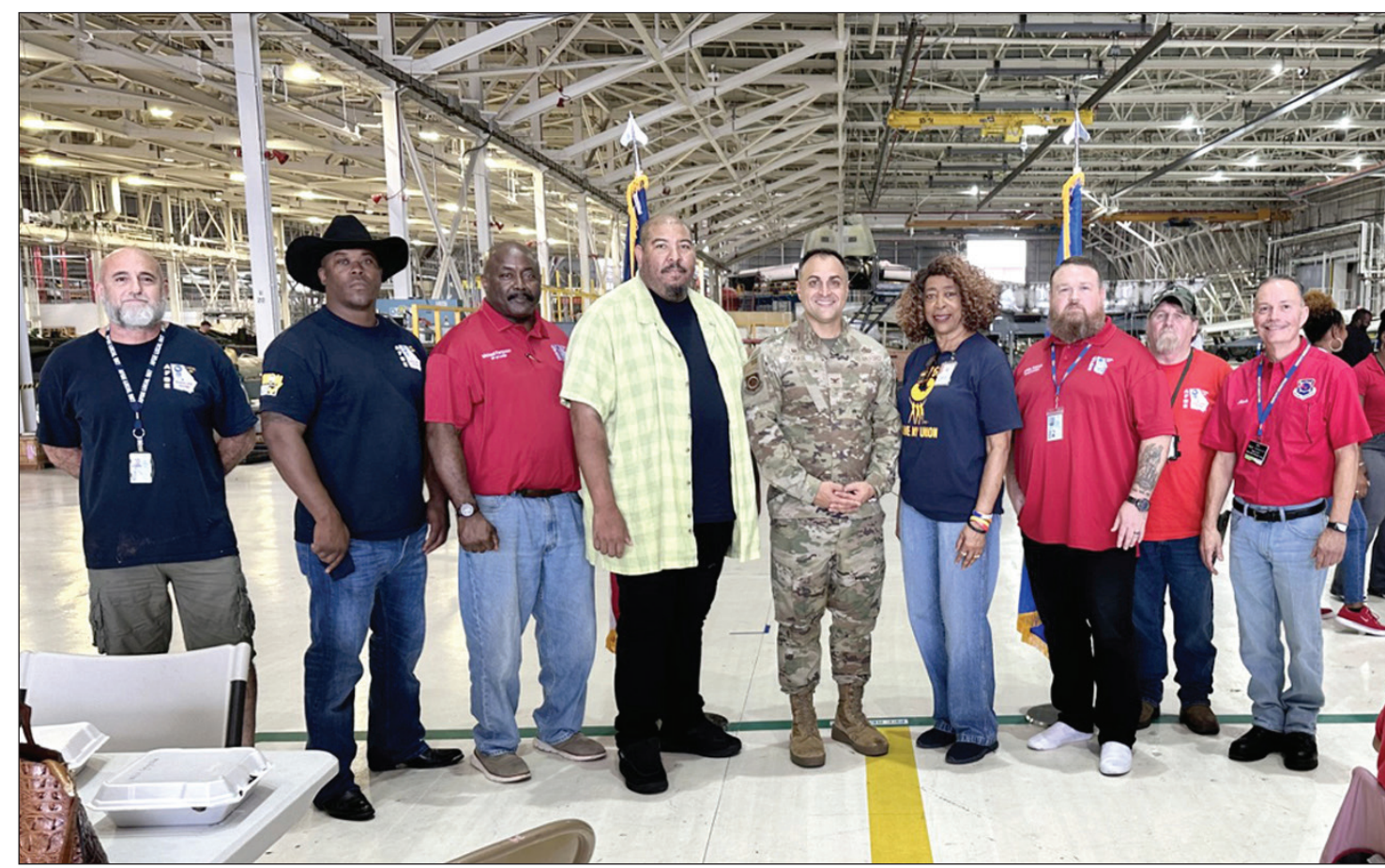
Pictured are some of those who worked to help make the event a success.