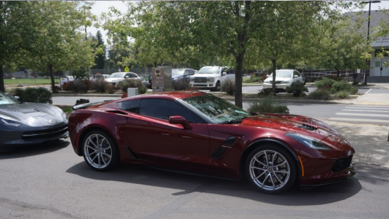
Rich Morton 3rd Place