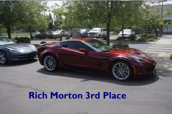
Rich Morton 3rd Place