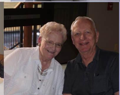
Wooden Shoe Tulip Farm