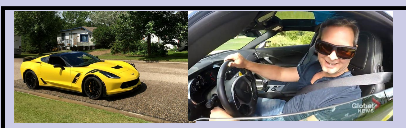
Legally blind for 44 years, man has sight restored and buys Corvette