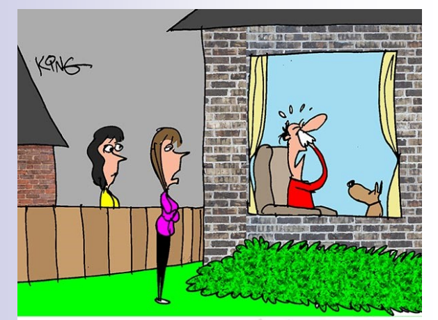
"No, he hasn't suffered a tragedy. He's sobbing because he's putting his Corvette away for the season."

Thanks for reading. As <u>www.MidEngineCorvetteForum.com</u> approaches 10,000 threads, we hope you have enjoyed the C8's news, discussions, conjectures, pictures and videos with us. More to come every day. Here's to many more miles of Corvette driving smiles