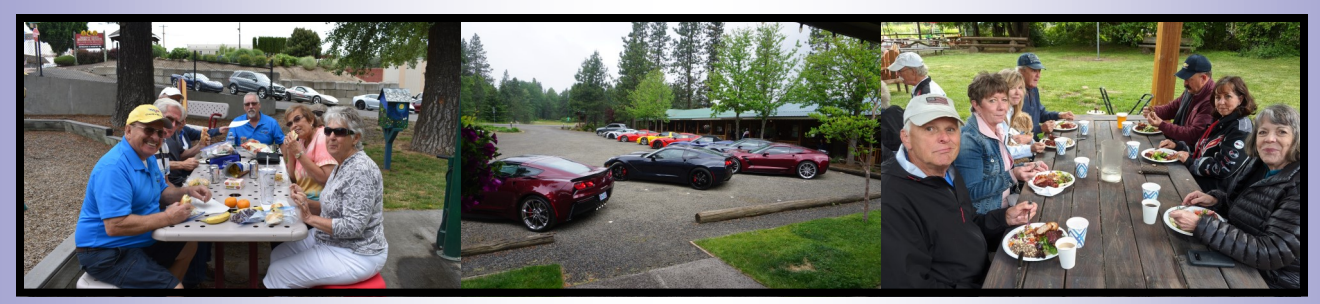
Out of Wine Tour