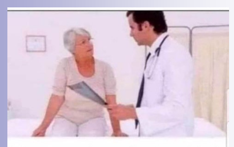
Doctor, when do you think covid 19 will be over? Doctor: I don't know, I'm not a Journalist.