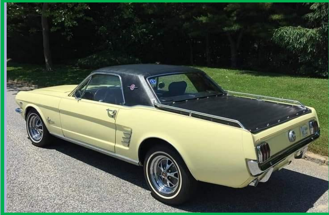
Mustang pickup 15 were made in 1965