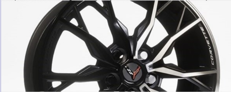
20-spoke bright machined-face forged aluminum (19" x 8.5" front and 20" x 11" rear)

Equally stunning is that none of the major options for the Stingray went up in price, i.e., such expensive components as the Z51 package, mag ride, front lift, the interior upgrades to the 2LT and 3LT trim packages do not have even a $1 additional cost . A couple of the more minor cost options actually had a price decrease. KUDOS TO GM!