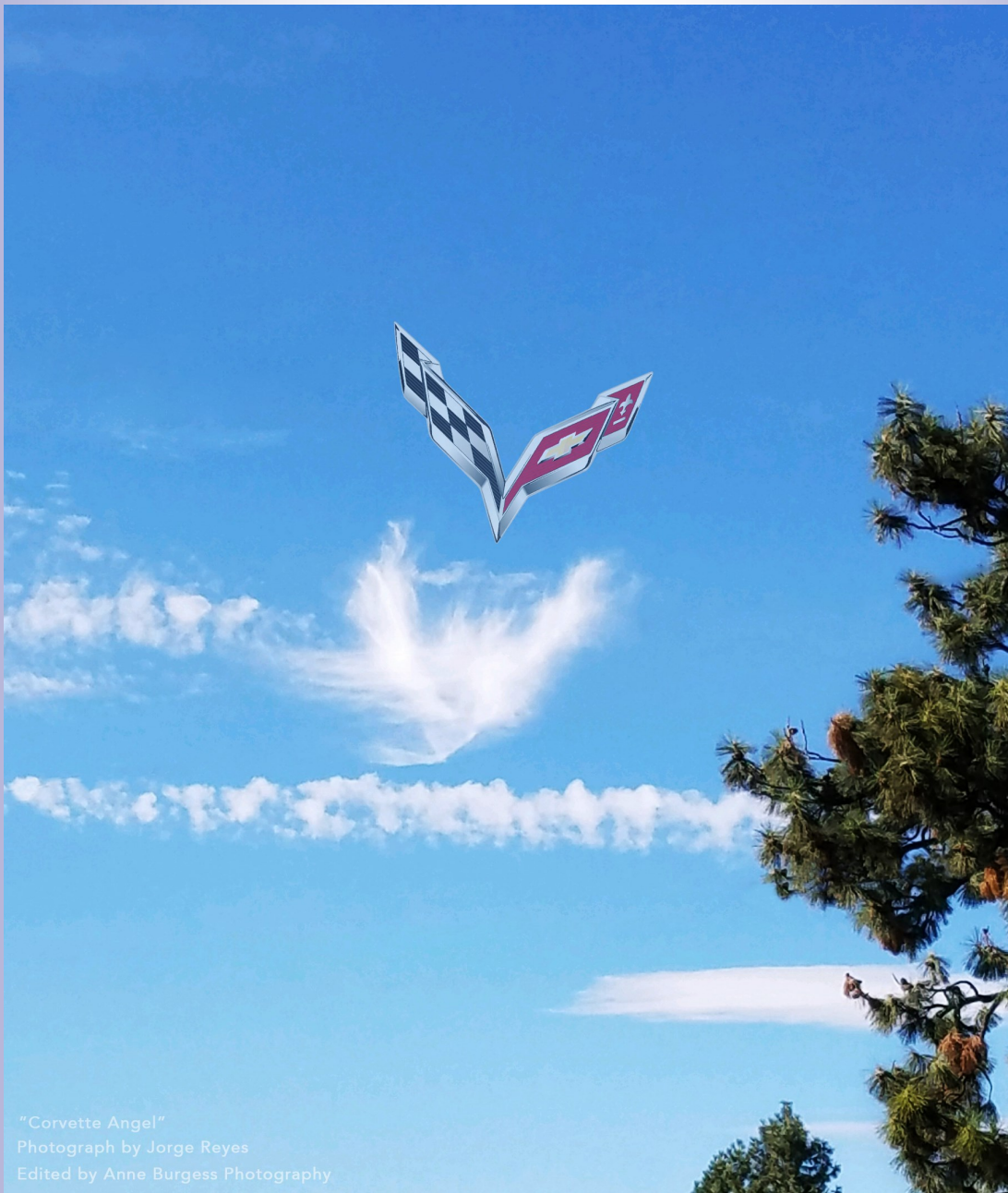
"Corvette Angel"