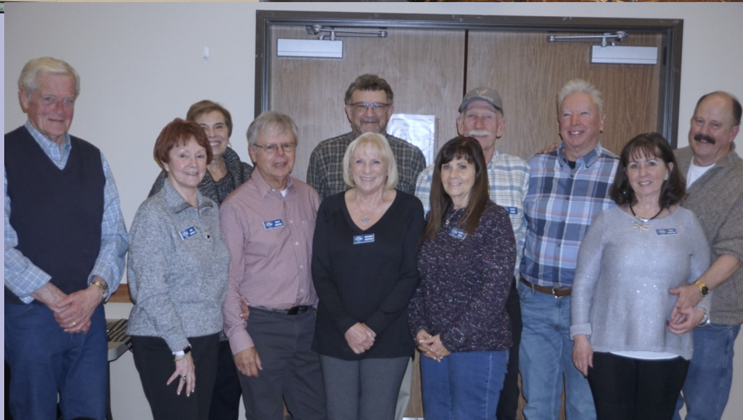
Officers and volunteers