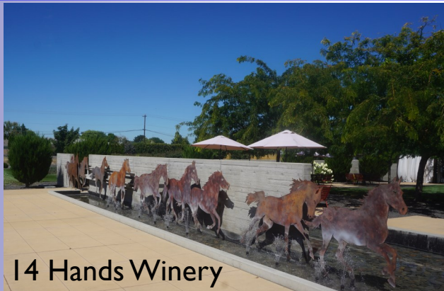
14 Hands Winery