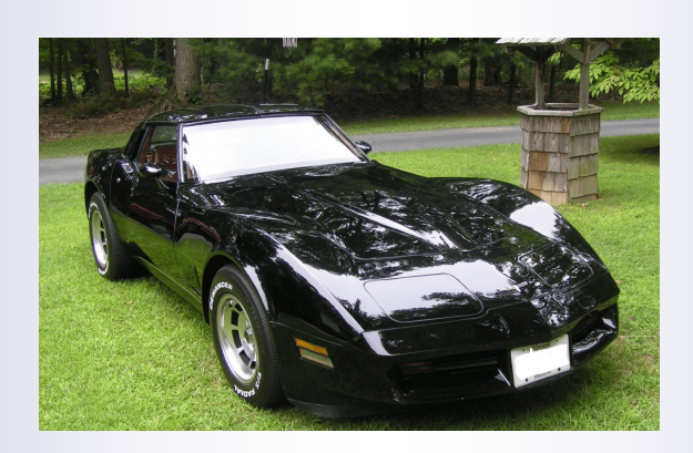
1980 C3 Corvette – California Emissions Power: 180 HP / Acceleration (0-60 MPH): 7.3 seconds