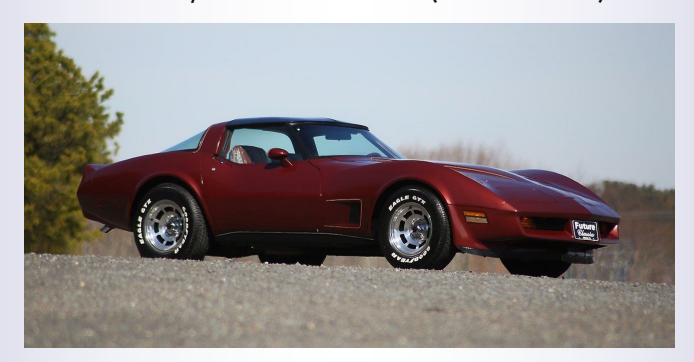
1981 C3 Corvette Power: 190 HP / Acceleration (0-60 MPH): 7.2 seconds