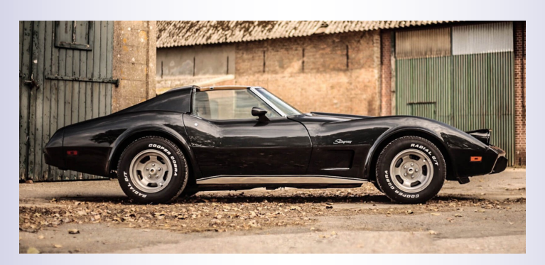
1975 C3 Base Corvette Power: 165 HP / Acceleration (0-60 MPH): 7.7 seconds