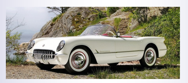
1953-54 C1 Corvette Power: 150 HP / Accel(0-60 MPH): 11 seconds