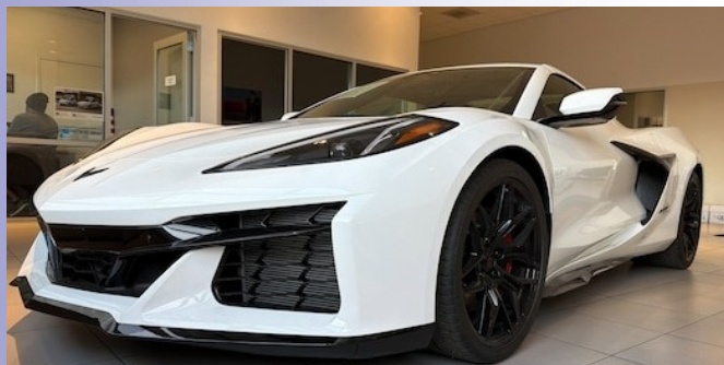
2026 Corvette Z06