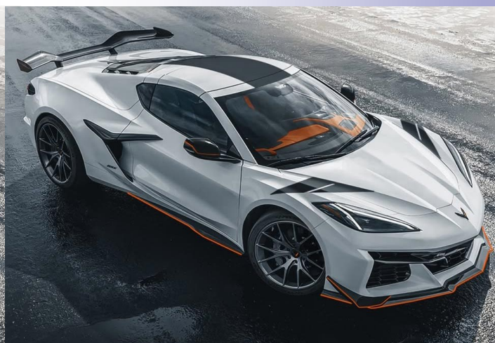
Without air scoop.