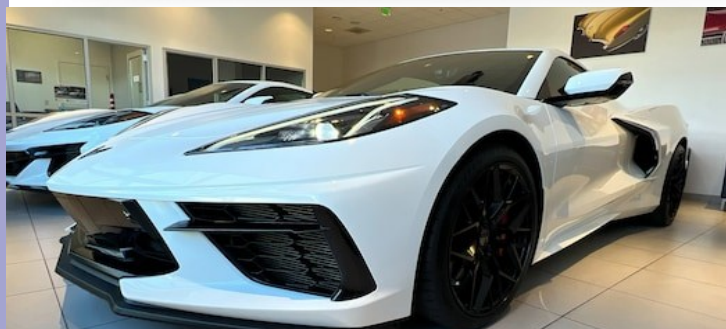
2020 Corvette 2LT