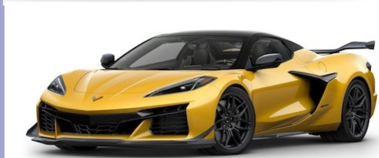
2026 Corvette Z063LZ