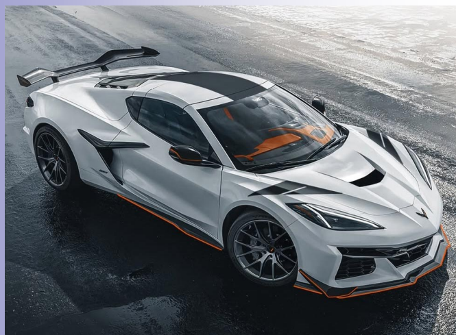
With pass-through Air scoop