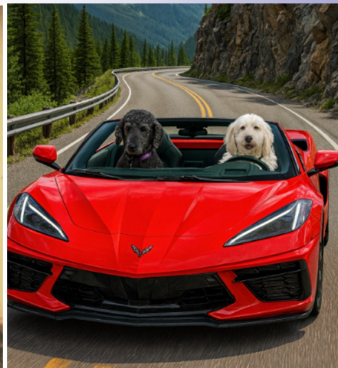
A dog day afternoon

If your mom had to use your middle name, it was already too late.