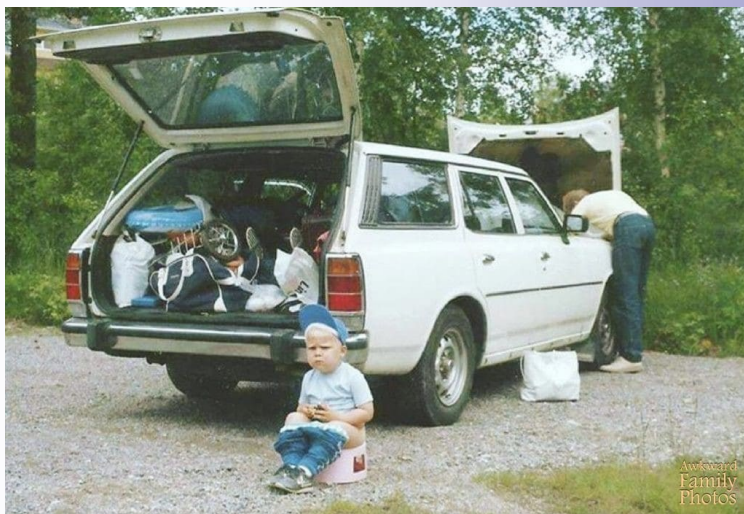
Road Trip Moments

They won't be laughing at Christmas when there's no eggs under the tree!