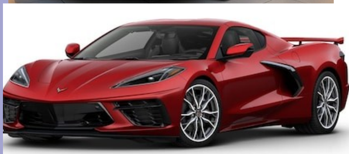
2026 Corvette LT