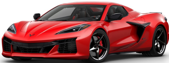
2025 Corvette E-Ray 3LZ