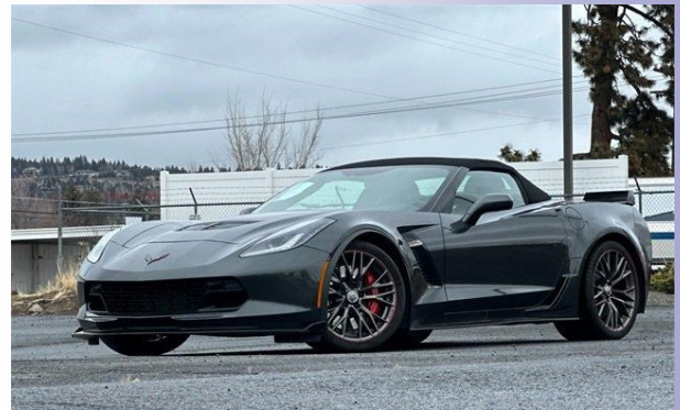
2015 Corvette 3LZ