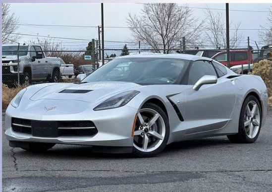
2020 Corvette 3LT