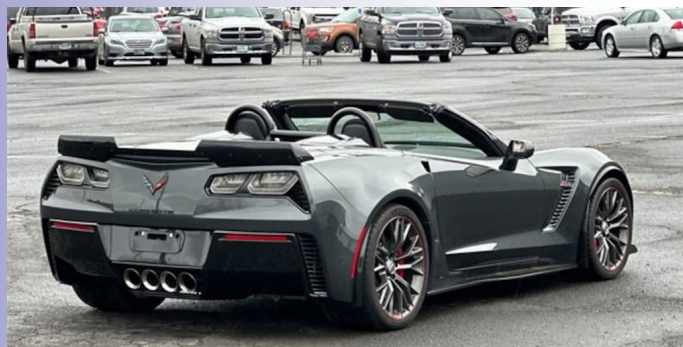
2019 Corvette HTC