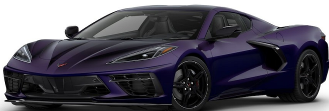
2025 Corvette Coupe 2LT