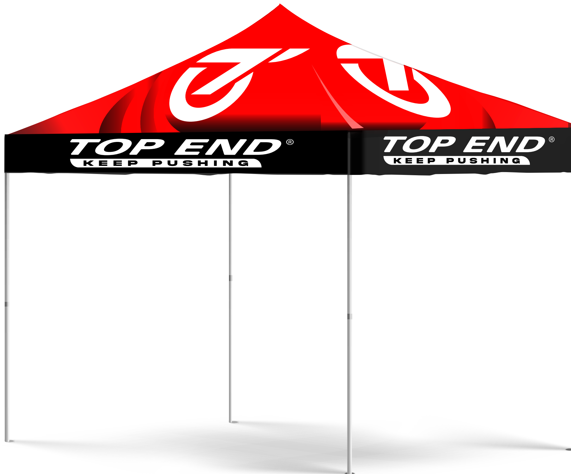
Feather Banner & 10 X 10 Pop-UP Tent