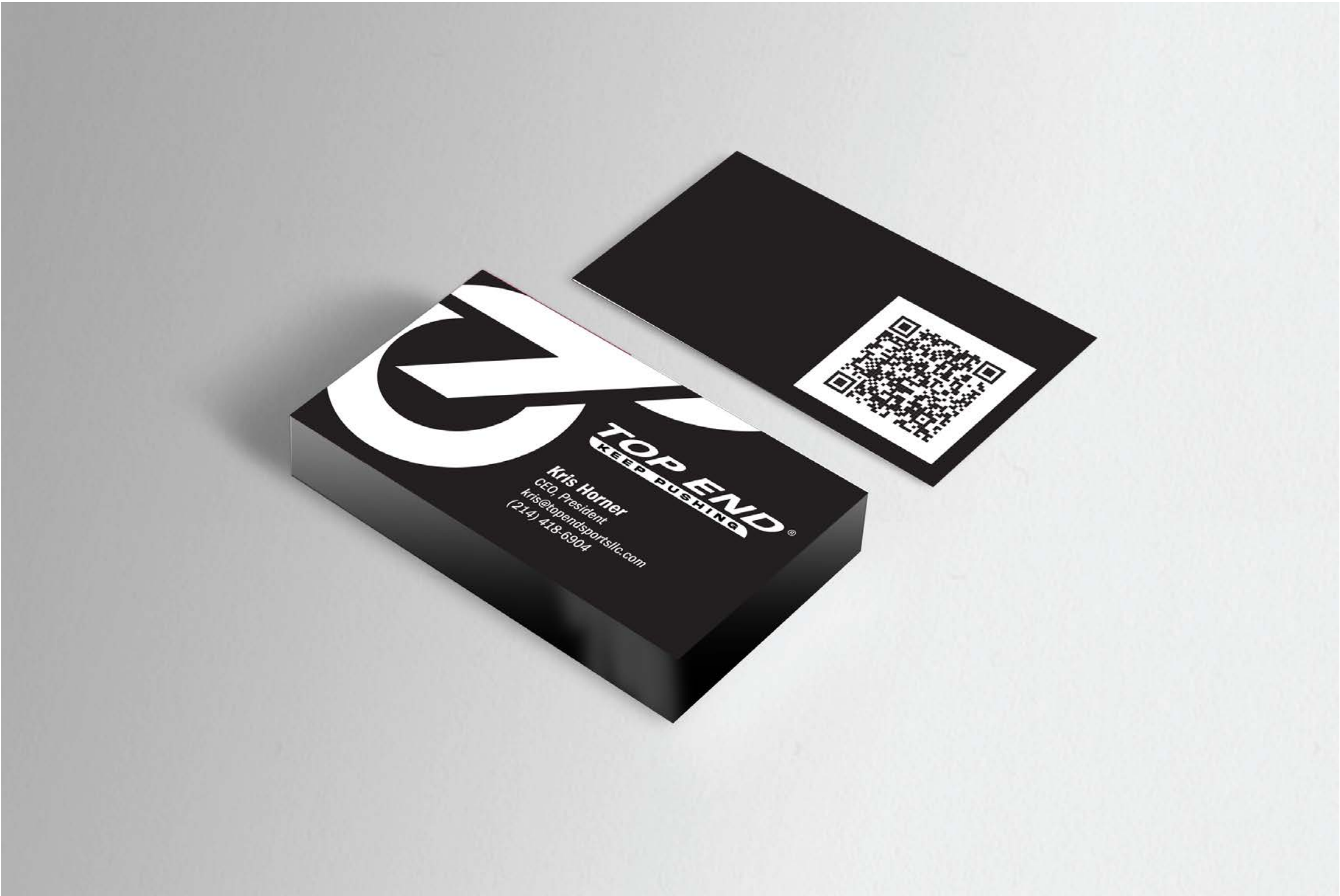
Business Card w/ Contact QR Code