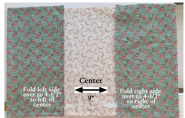
Fig. 2 – Fold in sides