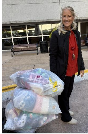
958 items to AdventHealth Orlando 11/25