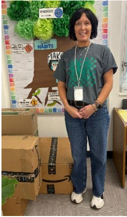
Delivery to Webster Elementary