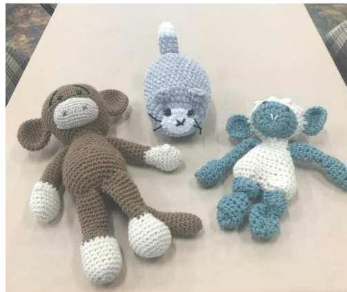
Crocheted toys at Everglades