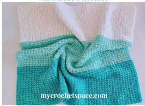
Easy Baby Blanket Crochet Pattern