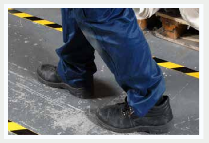
Bespoke permanent floor marking signs are instantly and immediately created with PermaCover, tough, durable and unique!

ReLINE is the World's most effective and durable aisle marking system. It is the modern alternative to resin and paint helping forward thinking companies achieve 5S status.