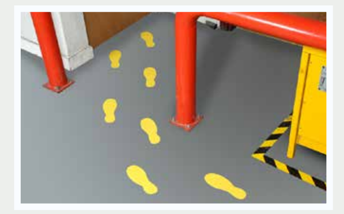
Any shape can be configured, we hold on our shelf ReLINE ready cut in letters, numbers and shapes. You can however choose any shape or character you prefer. Our cutting process is accurate to 0.1 mm