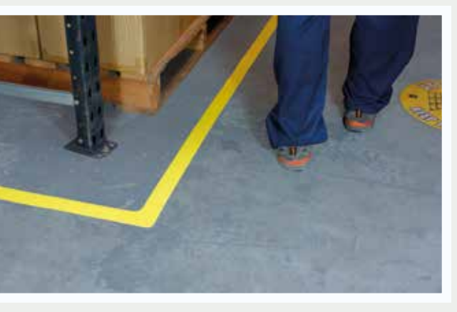
ReLINE Smooth is perfect for clean rooms and kitchens. It does not feature the embossed surface making it easy to clean and reducing the ability to trap dirt and bacteria.