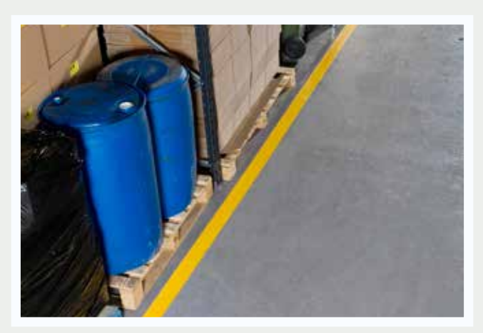
Aisle markings clearly show boundaries improving safety and tidiness.