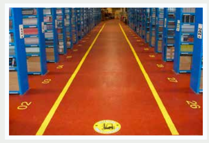
Unlike paint, ReLINE is durable yet easily removed.