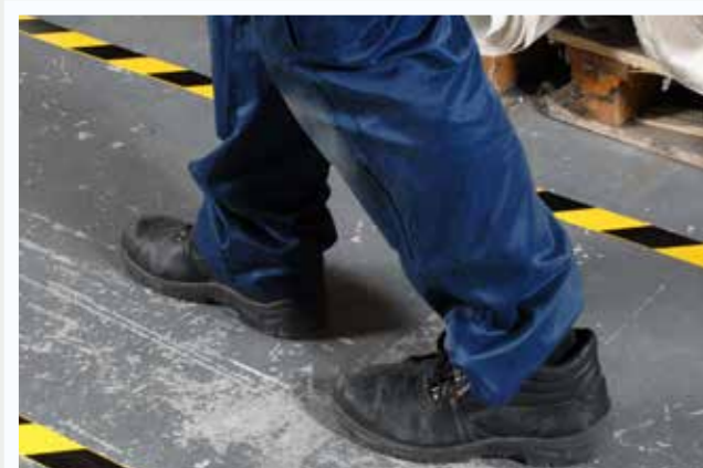
Bespoke permanent floor marking signs are instantly and immediately created with PermaCover, tough, durable and unique!

ReLINE is the World's most effective and durable aisle marking system.