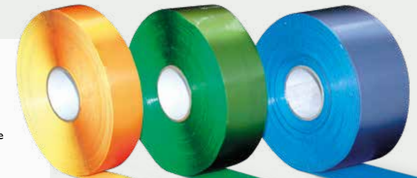
Rolls 50mm, 75mm or 100mm wide