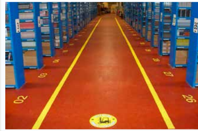
Unlike paint, ReLINE is durable yet easily removed.