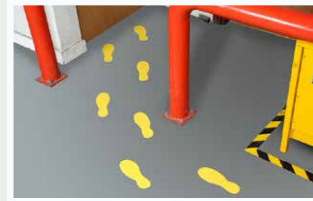
Any shape can be configured, we hold on our shelf ReLINE ready cut in letters, numbers and shapes. You can however choose any shape or character you prefer. Our cutting process is accurate to 0.1 mm