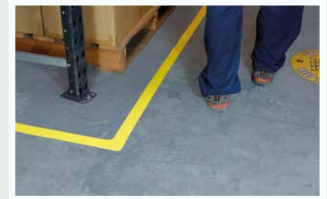
ReLINE Smooth is perfect for clean rooms and kitchens. It does not feature the embossed surface making it easy to clean and reducing the ability to trap dirt and bacteria.