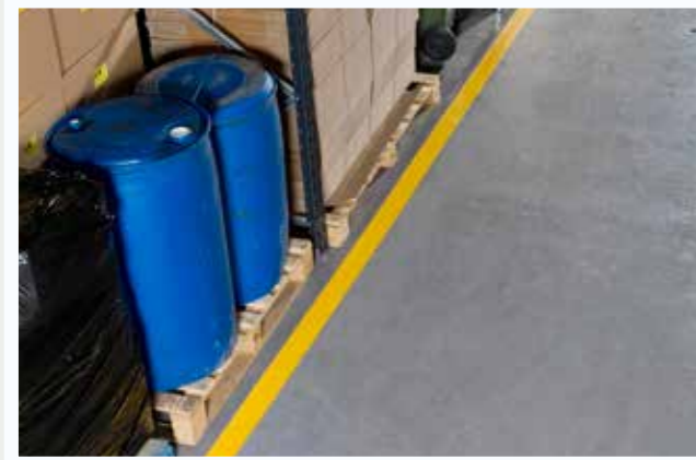
Aisle markings clearly show boundaries - improving safety and tidiness.