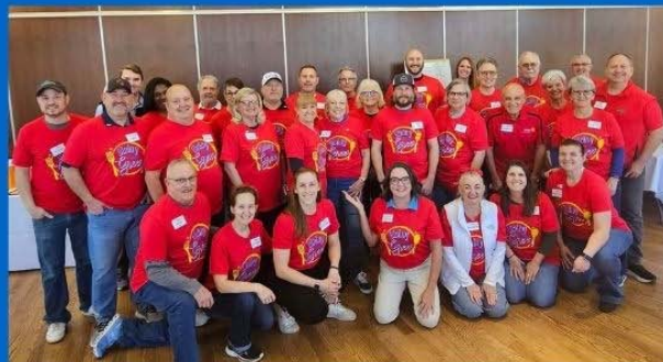
Dining Around Greer