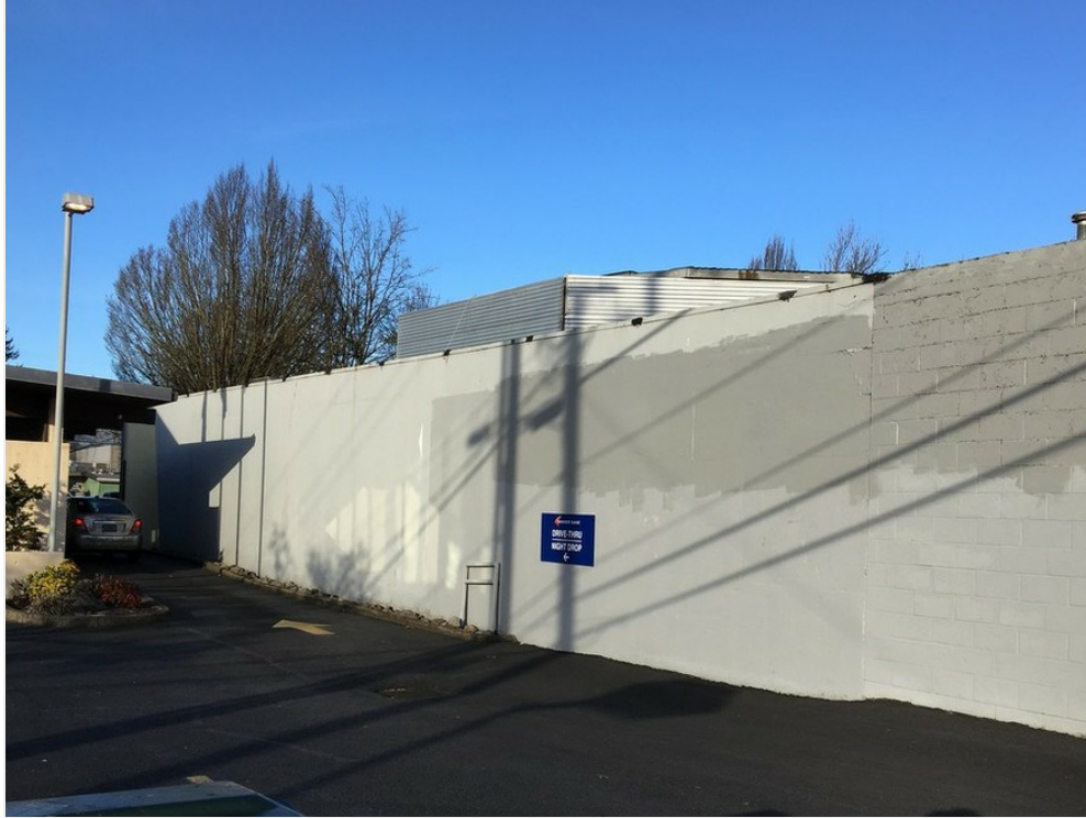
West Exterior Wall