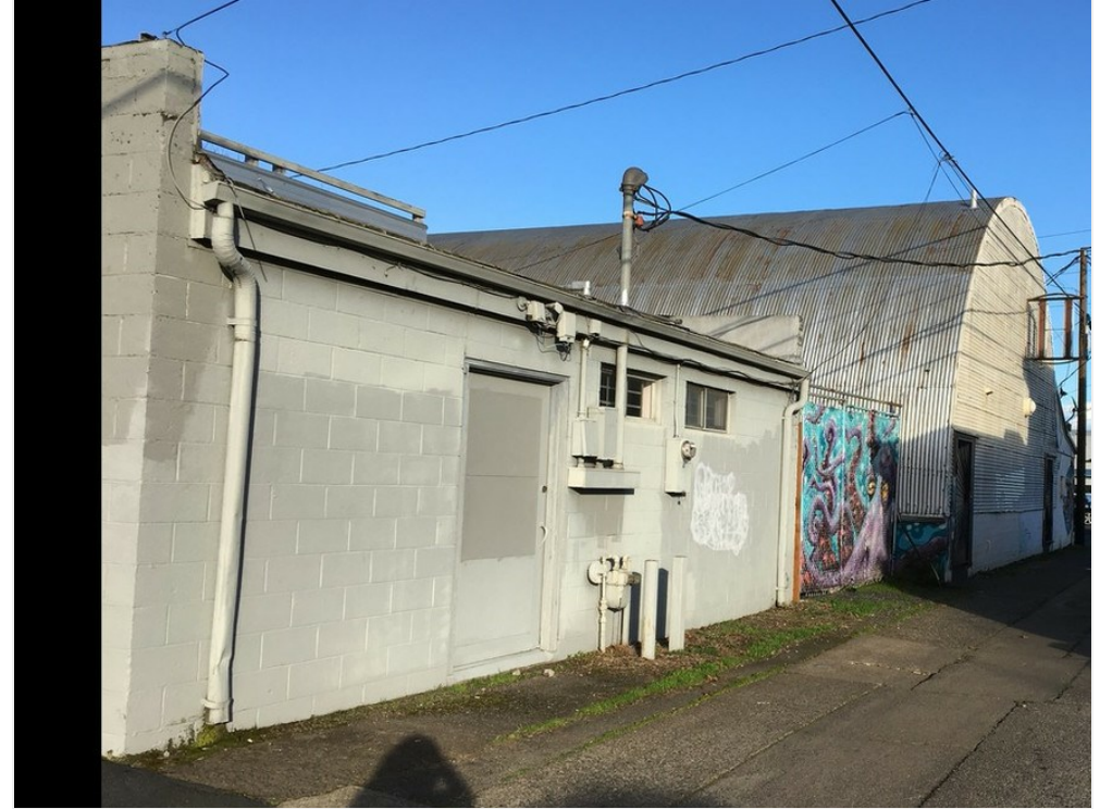
Rear Exterior of Building