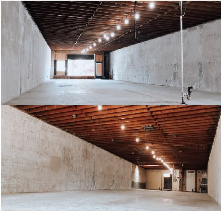
Clean Shell Condition