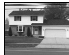
1222 Nash Rd N. Tonawanda 3BR/1.5BA colonial