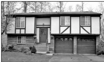
244 Denrose - 3 BR/1.5BA Raised Ranch

Do you know a buyer for these Willow Ridge homes?