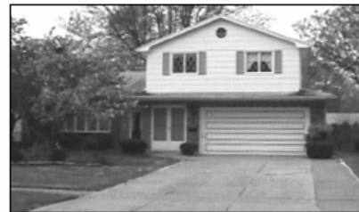
72 N. Brier - 3BR/1.5 BA Split Level

Here are some of my other available properties: