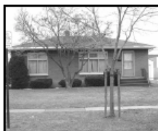
85 Emerson Amherst 3BR/1BA Ranch