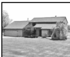
4226 Tonawanda Creek Waterfront - Pendleton 4BR/2.5 BA Colonial

Here are some of my other available properties: