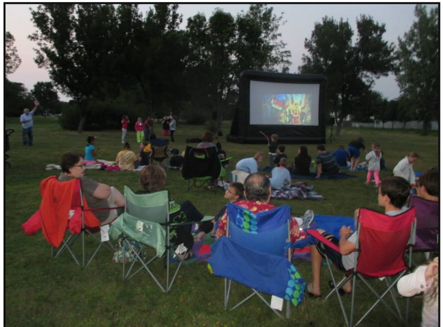
Nearly 150 friends and neighbors came out for the 2014 Movie Night.