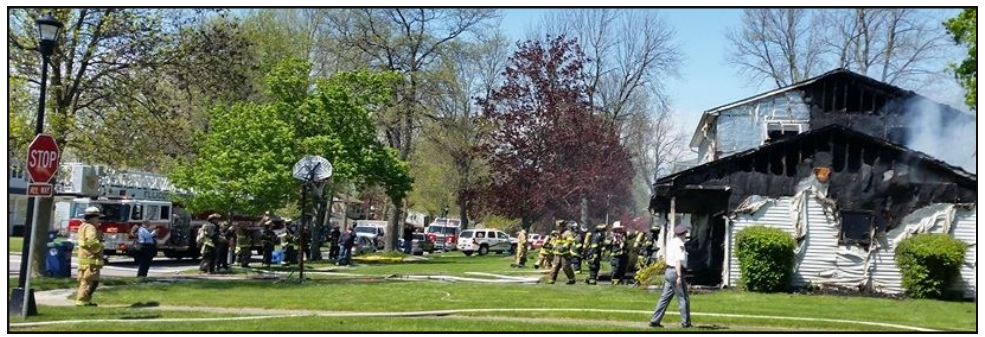
Four fire companies responded to the blaze.