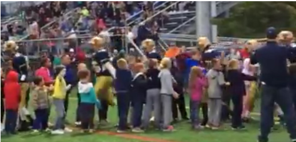
Local elementary students helped to kick off the game by walking the cheer team and the varsity football players into the stadium.

Lastly, the Sweet Home Athletics Hall of Fame enshrined eight new inductees at halftime as part of its Class of 2016.