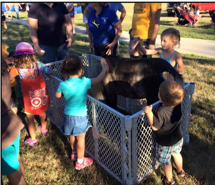
The miniature ponies are always a big hit at National Night Out.

Thank you to all of the neighbors and volunteers who make Willow Ridge a wonderful place to live and play.