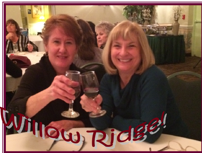
Wine Tasting Memories!

Next up, Snowflake Dinner Dance March 12, (see page 7)