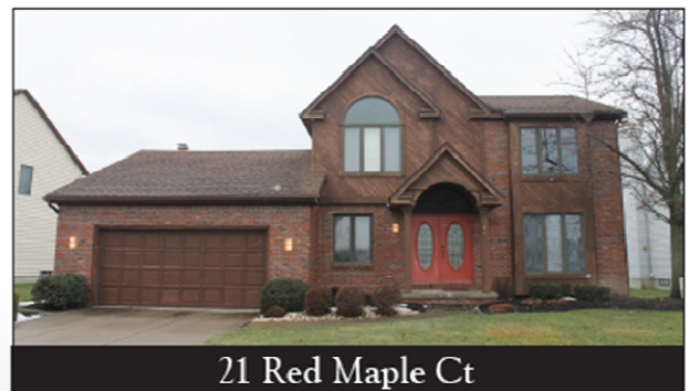
21 Red Maple Ct

Who do you know that would like to live in OUR neighborhood?