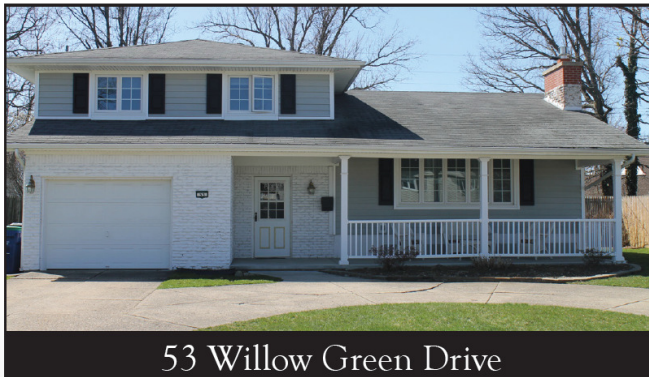
53 Willow Green Drive

Who do you know that would like to live in OUR neighborhood?