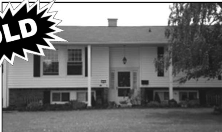
5 Dalewood Drive