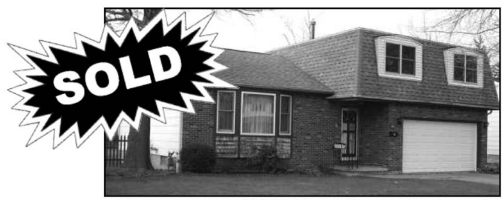
182 Parkhaven Dr.