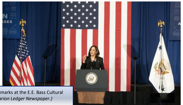
IN THE PICTURES: Congressman Bennie Thompson and Vice President Harris provide remarks at the E.E. Bass Cultural Center in Greenville in support of small businesses.