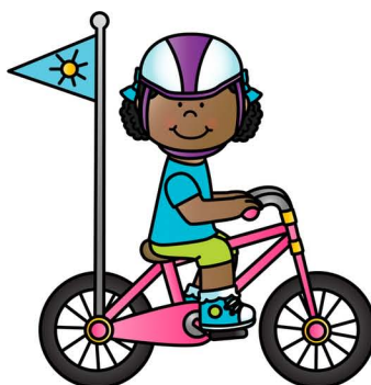
Text On Back Bicycling Motions