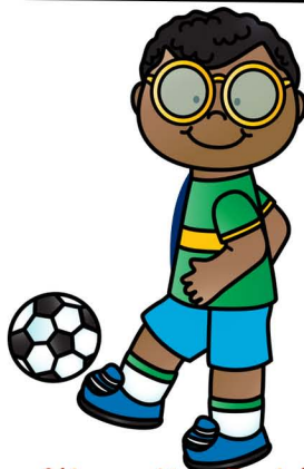
Alternating Feet Kicks