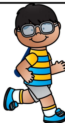
Run in Place