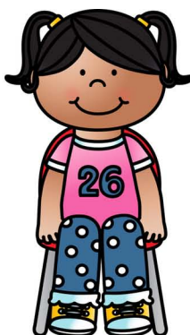
Sit and Stand