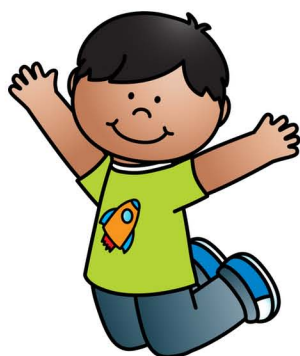
Jump in Place