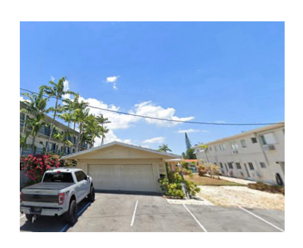
1545 SE 15th Street