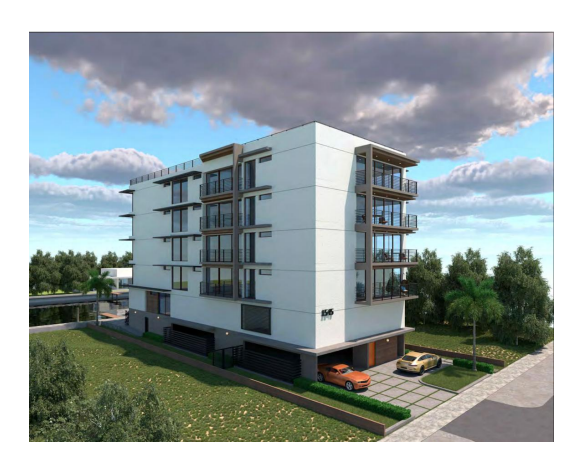
Proposed Five Story Building