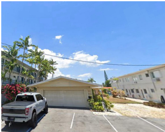
1545 SE 15th Street