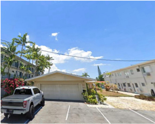
1545 SE 15th Street