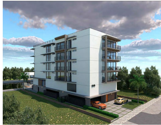
Proposed Five Story Building