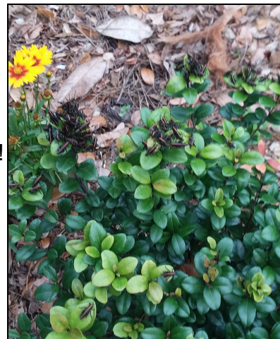
Lubbers are here!