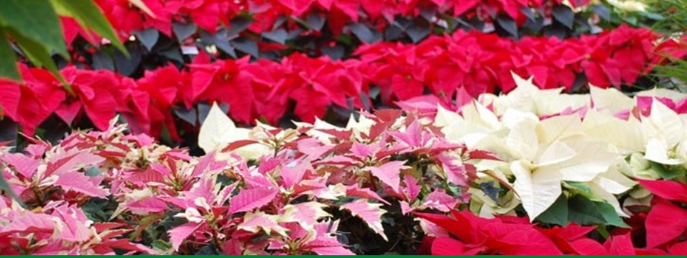
Volume 32, Issue 4