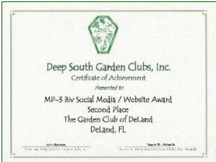
Deep South Garden Clubs, Inc. Facebook Award