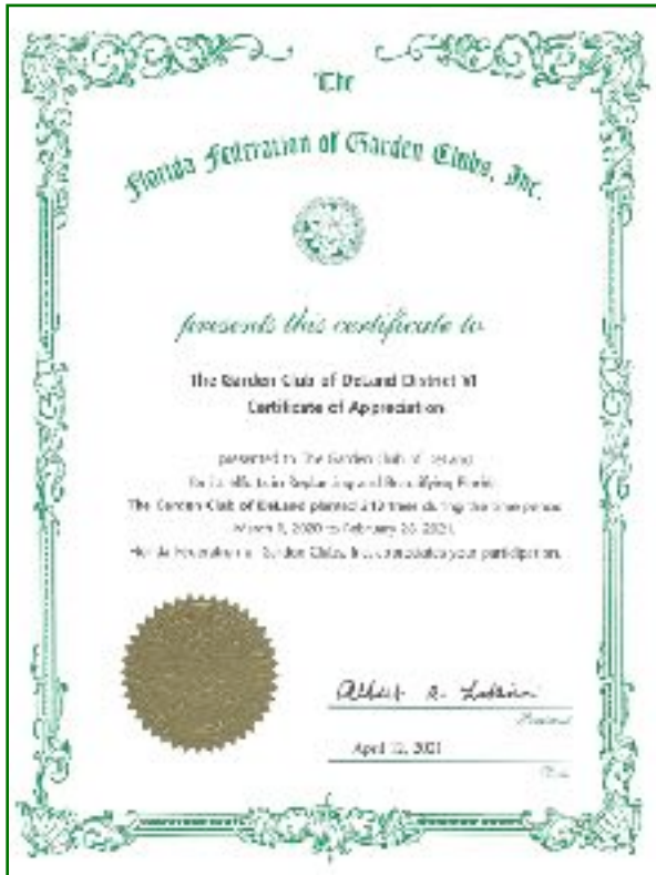
Recognition for counting Trees. We were in the top 10!