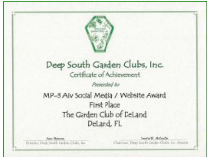
Deep South Garden Clubs, Inc. Website Award