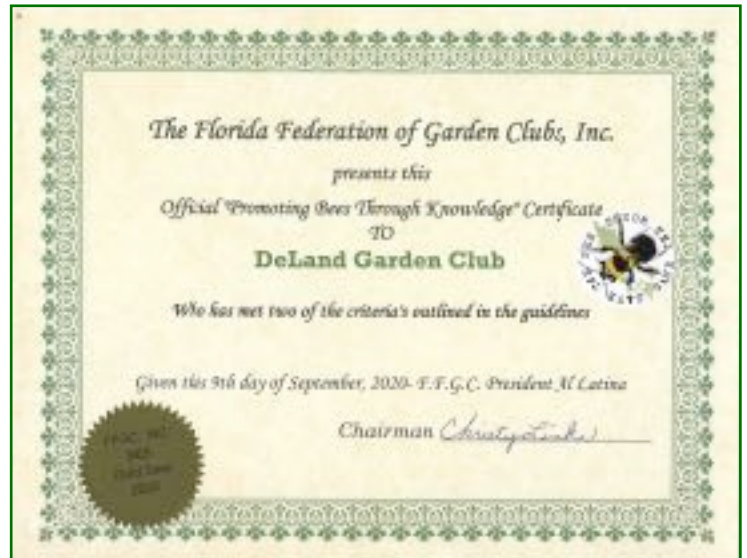
Bee Award from Florida Federation of Garden Clubs, Inc.

In late May, we will find out if we won awards at the National Level with National Garden Clubs, Inc.