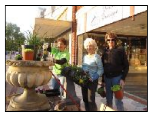
Join us Downtown DeLand

The first Saturday of every month a group of members heads Downtown to take care of the planters...Weeding and deadheading downtown are ongoing tasks and the Circles taking care of their section is very valuable and appreciated. You may do this any day of the week, preferably around the middle of month. The beautification committee tends to the downtown planters the rest of the month.