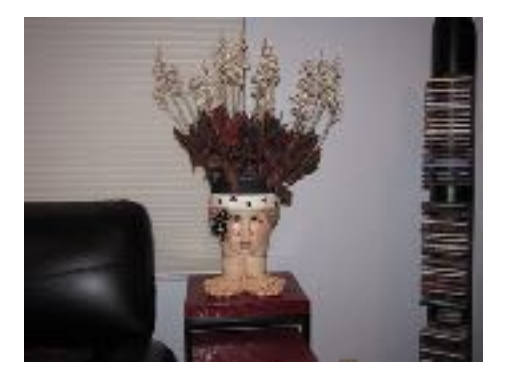
The Garden Club enjoys the lighter side of LIFE.

check the calendar for meetings and program topics)