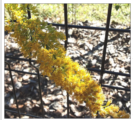
the flower blooms.

about 6 feet tall and it will attract native bees and insects to its flowers.